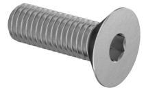
M8x35mm Countersunk Bolt